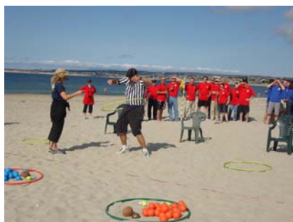
Competitive Team Games